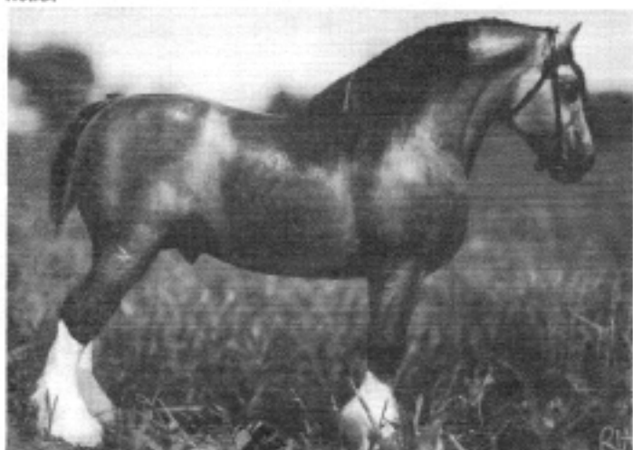
#1—Rohirrim Twilight: Dapple Grey Shire stallion by Michelle Belisle, owned by Nancy Olson.

For the Shire stallion on the Clydesdale mare I add muscling on the chest and shoulders, and a little on the hindquarters. The feathers are the hardest to remake on this model. I usually cut off one front leg and one back leg and then grind off most of the plastic with our table grinder, then I use the soldering iron, finishing up with files. After the feathers are sanded off, I re-attach the legs to the model. Photo #1 is a dapple grey stallion done on a Clydesdale Mare. The head shot is a bay mare, a good example of a remade head.